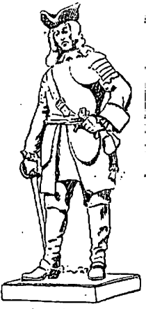
Statue of Oglethorpe.